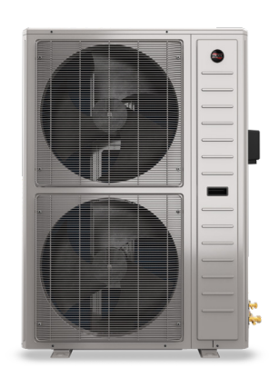
5 ton RD17AZ60AJ3NA