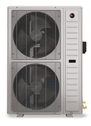
4 ton RD 17 AZ 48 AJ 3 NA