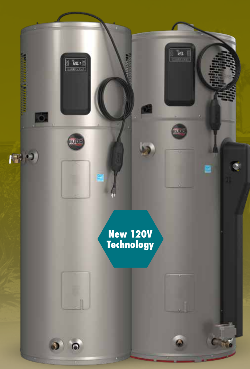
Ruud® Ultra™ Plug-in Heat Pump