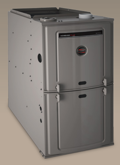
Achiever Plus™ Series