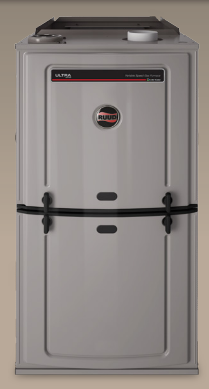
Ultra <sup>™</sup> Series