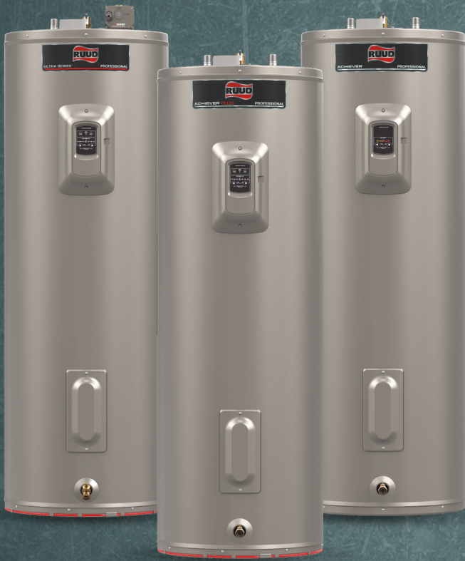
Smart and Standard Electric with Demand Response