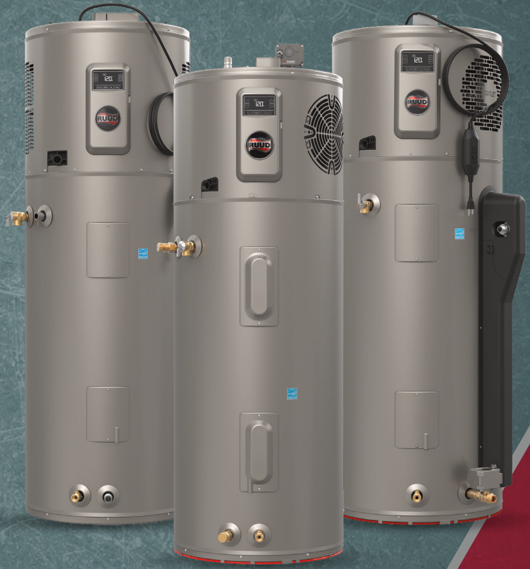
Ultra™ Heat Pump Water Heaters with Demand Response